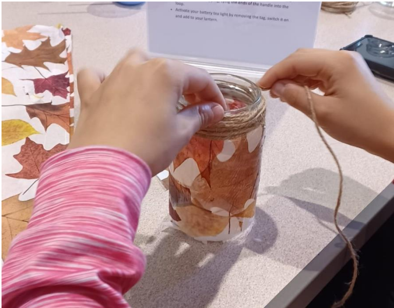
Making Autumn Lights